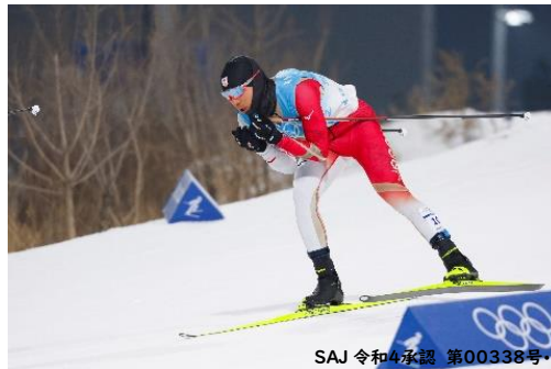
SAJ 令和4承認 第00338号

We received many messages of support from those who attended this