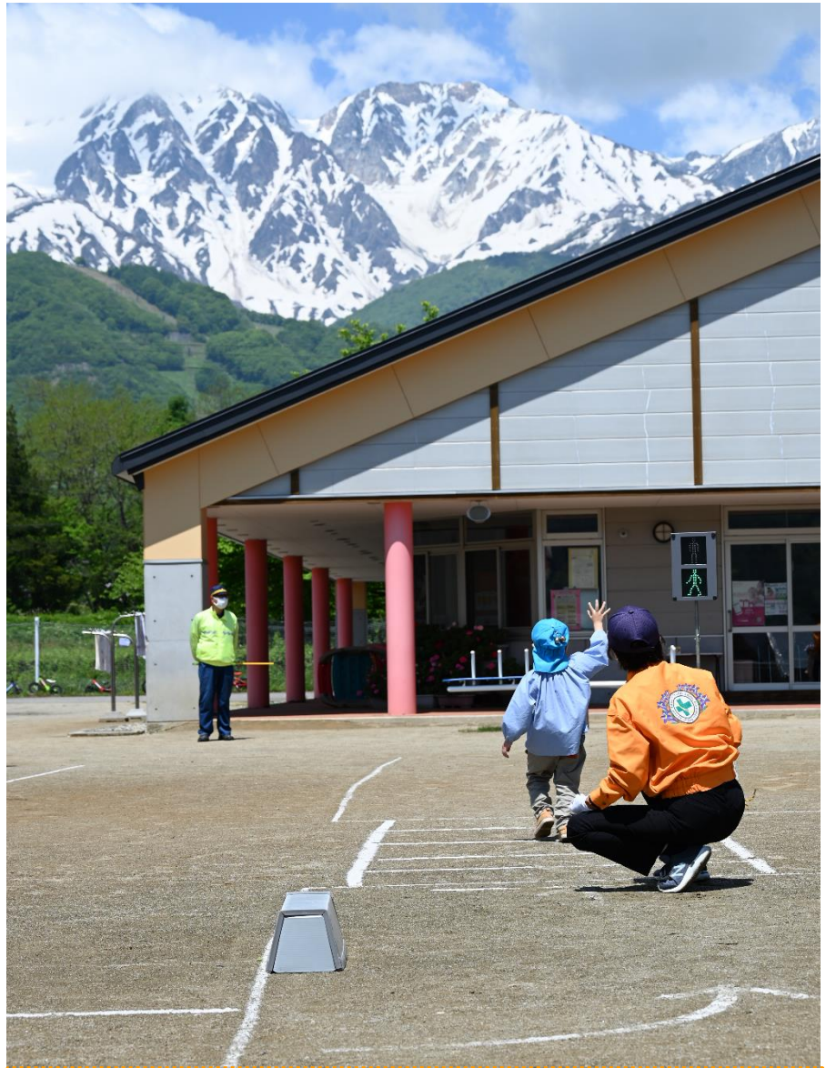
On Monday, May 23, a traffic safety class was held at Shirouma Hoikuen (:Pre-school). Last year, the event was held indoors due to rain, but this year, the weather was fine and the event was held in the Shirouma Hoikuen yard and on actual roads with crosswalk. The children learned that when crossing the street, they should use the crosswalk, raise their hands, and certainly look both ways before crossing.

■ If you buy a car, get an fuel-efficient car. Compared to gasoline-powered vehicles, hybrids emit about 30% less carbon dioxide when running and electric vehicles emit about 40% less carbon dioxide and cost less for fuel. Changing what you eat will change you and our environment.