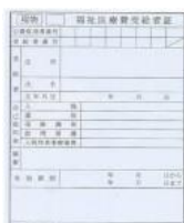
Social Welfare Certificate (in case, if you have children age under 18)