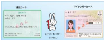
My number card/notification card