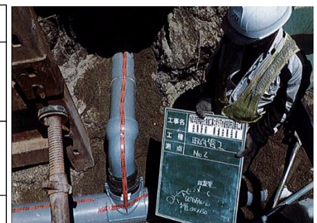
Construction of sewage pipes due to the installation of utility poles (Hakuba Station Area)