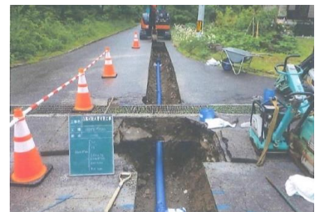
Replacement of water pipes (Misorano)

The water supply account performed better, with net income rising 7.6% above FY2023, boosted by the upcoming rate revision in January 2025 and growing tourism demand.