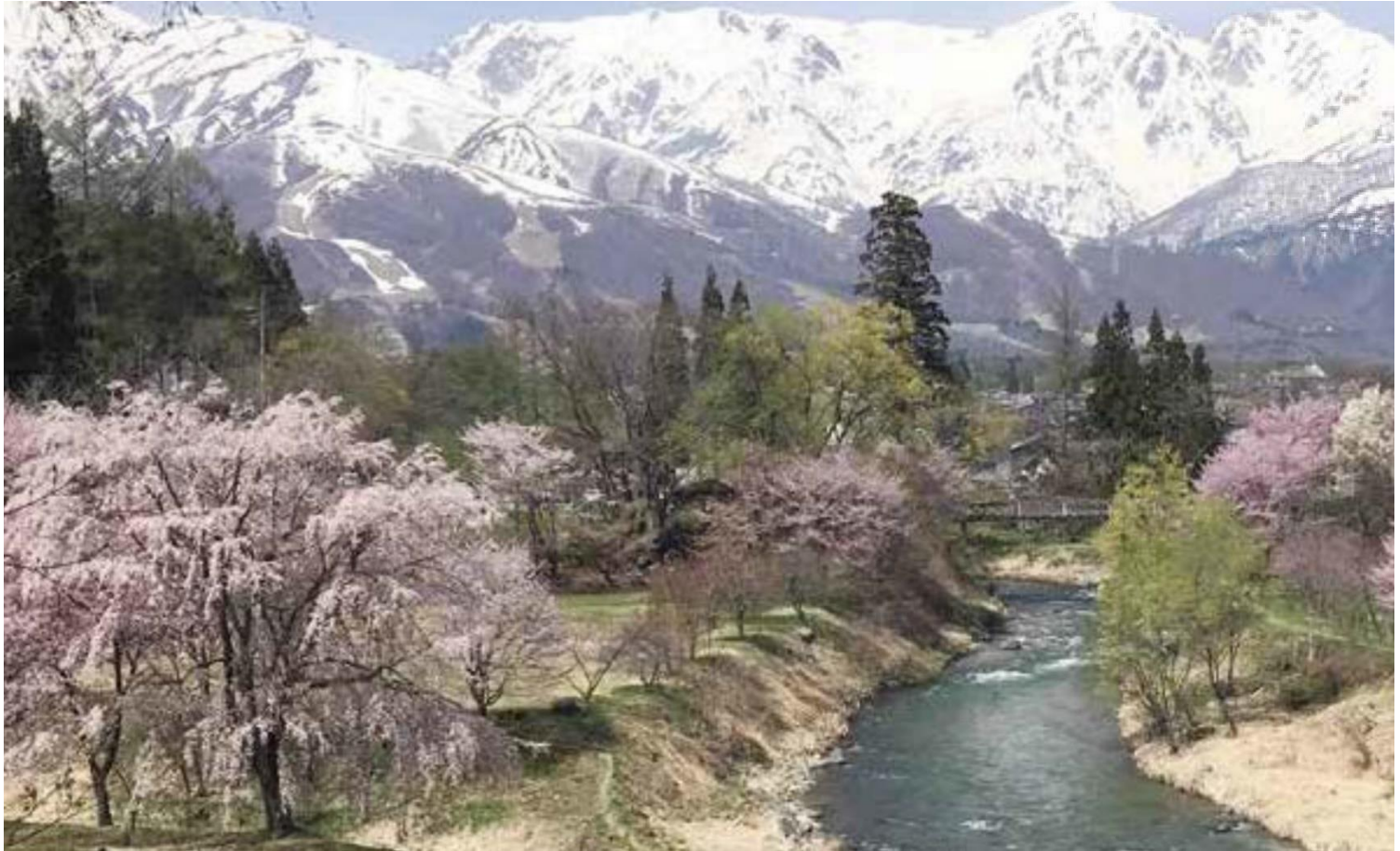
Posted photo project has started. It is the first photo.

A message from mayor of Hakuba village Masatake Shimokawa