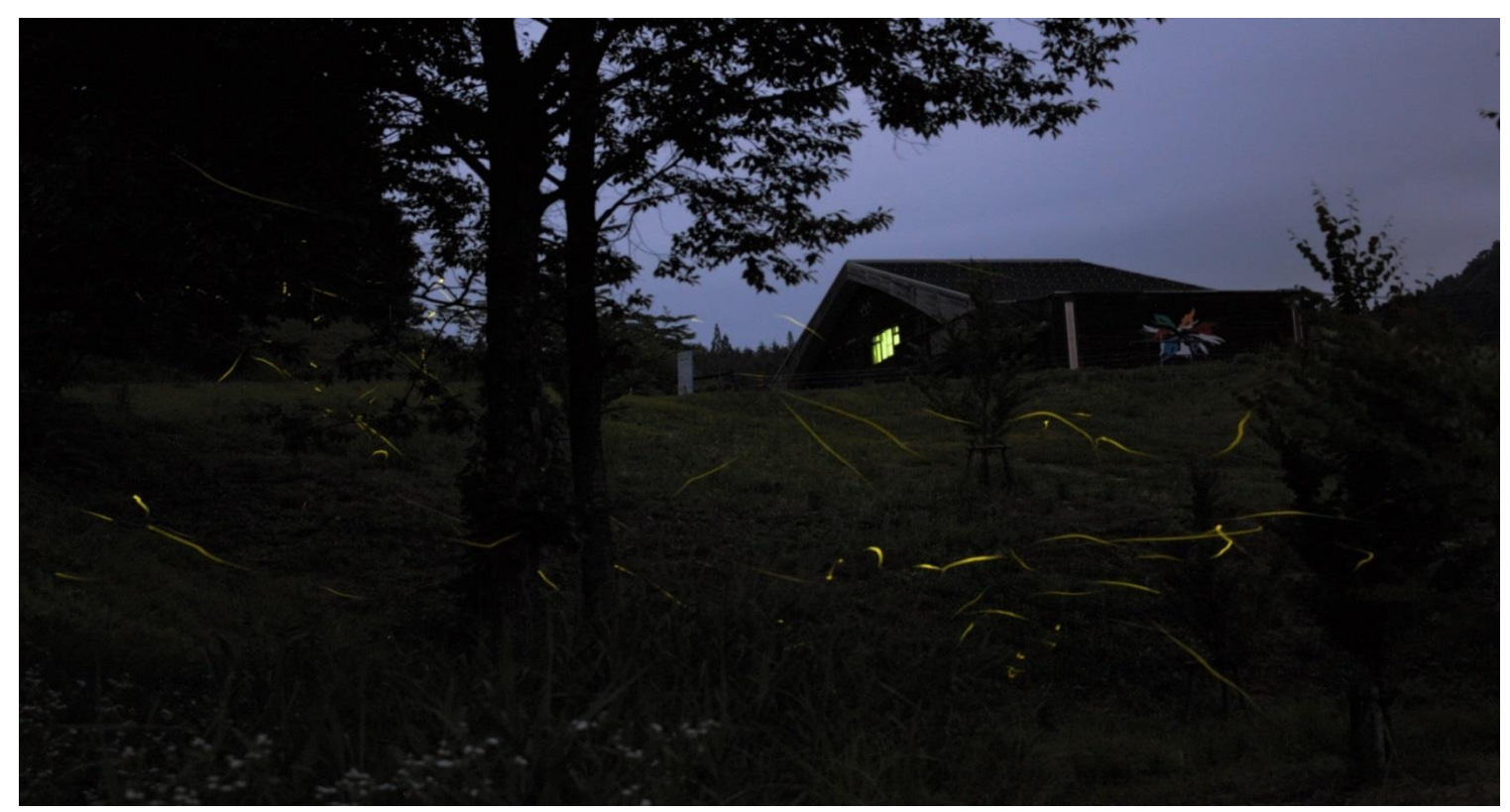
[Fireflies dancing on the Nagano Olympic emblem] at Snow Harp