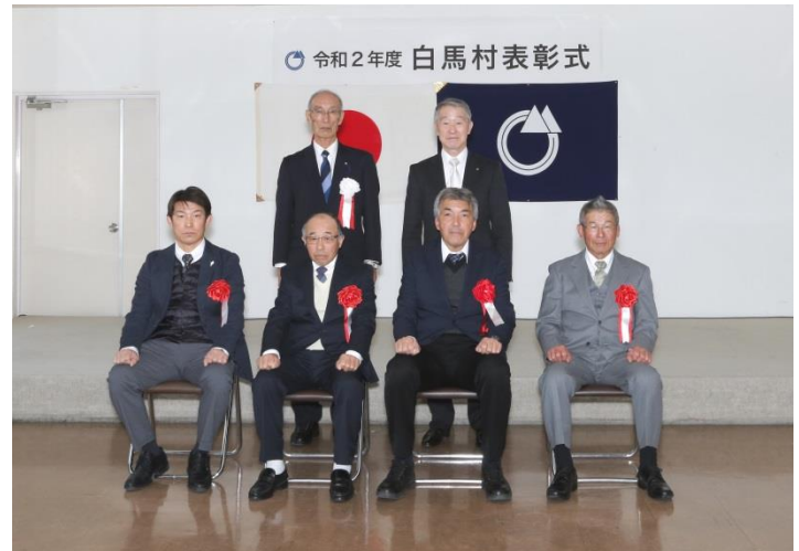
On November 3rd, Culture day, this year's village Awards Ceremony was held. Certificates of Appreciation were presented to four outstanding professionals from the three categories of firefighting Achievement, Technical Achievement (carpenters and electricians), and Educational Achievement.

Let's live through this corona disaster with the community unit that was once called the Miracle of Hakuba Village.