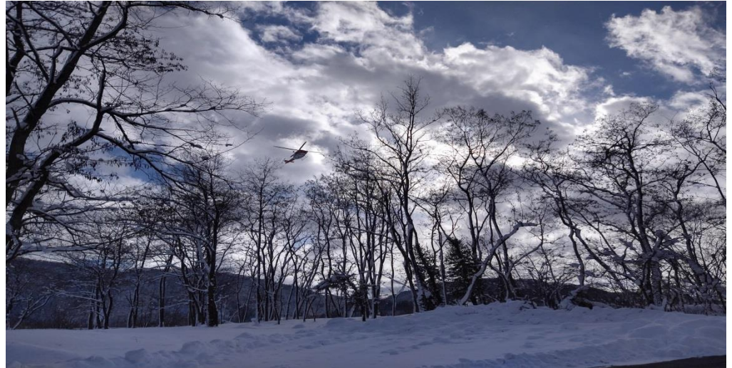
Nagano Prefecture's new firefighting and disaster prevention helicopter has arrived at Matsukawa Helicopter Port.

This is a request for cooperation from Nagano Prefecture to businesses.