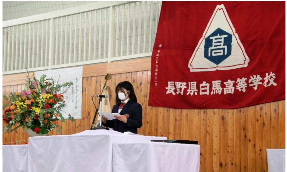
A girl representing the students at the Hakuba High School graduation ceremony on March 1, 2021.

The Tokyo Organizing Committee of the Olympic and Paralympic Games Tokyo 2020 announced guidelines covering COVID-19 countermeasures that will be implemented during the Tokyo 2020 Olympic Torch Relay, which will start from Fukushima Prefecture on Thursday 25 March 2021. The guidelines have been formulated to ensure protection for all those who participate in, support and watch the Olympic Torch Relay, as well as local residents. These include the countermeasures outlined below, which will be based on the COVID-19 infection status in the individual prefectures where the Olympic Torch Relay will be held and are therefore subject to change.