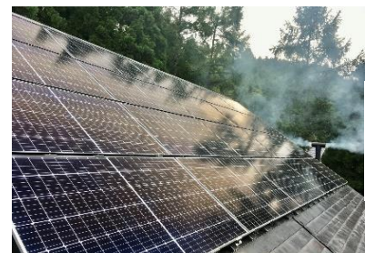
In summer, solar generates electricity well.

Hot water produced by a wood-fired boiler supplements the entire building.