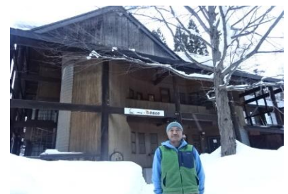
The owner of Albergo Il Bosco

Forest trees absorb and fix atmospheric carbon dioxide through photosynthesis. Burning the wood from these forests as energy produces carbon dioxide, but if the forest grows after the trees are cut down, the carbon dioxide is absorbed back into the trees during their growth. The use of wood for energy has carbon neutral